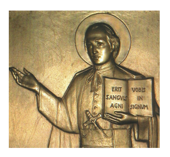
Voice of the Founder

In the Blood of Jesus Christ let all find the fountain of all good things, repose in trials, the security and peace one can have when hesitation arises...the union of love, the foundation of faith...the basis of Christian patience, the cause of rejoicing in Heaven.