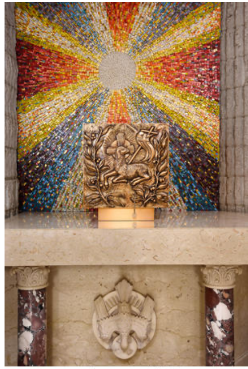
www.alamy.com - K081R4