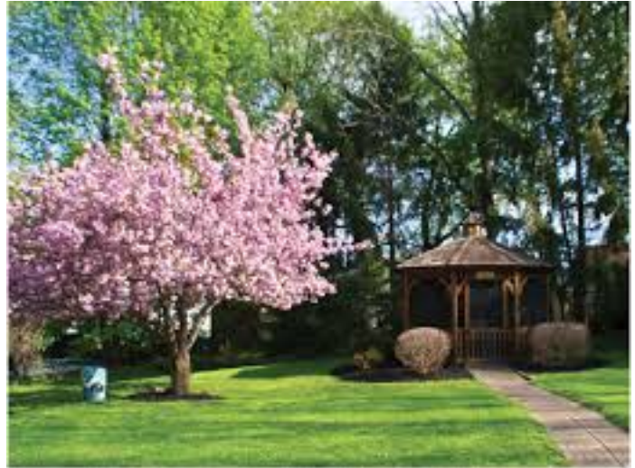
History of St. Mary of Mt. Carmel Parish; Chicago, IL

Given the importance of this parish in the history of the Atlantic Province, I am including below a photostatic reproduction of its history.