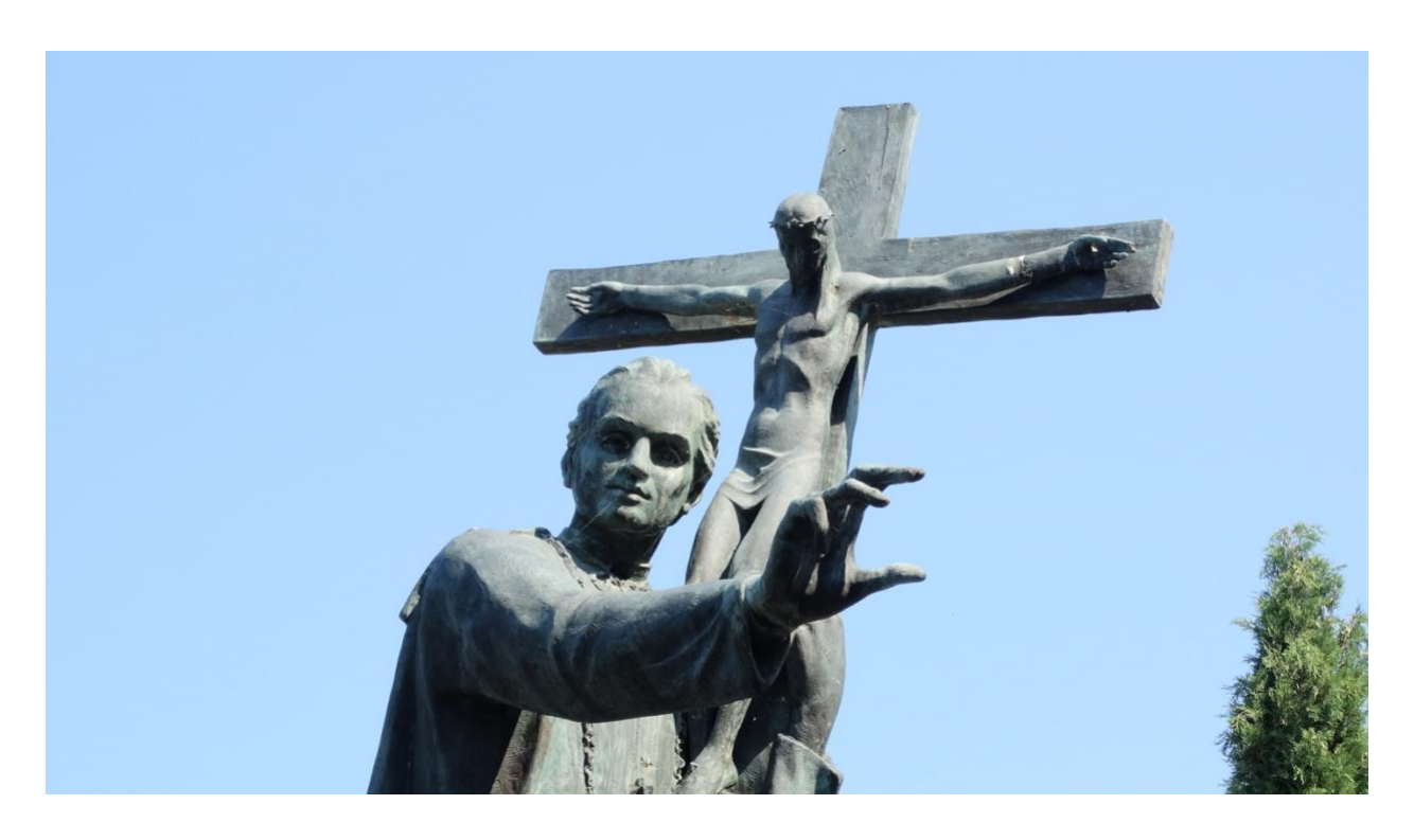
Voice of the Founder

May the Lord, during these very holy days, fill you with a most ardent zeal for his glory. From that zeal flows the eagerness to work hard in the evangelical field in order to maintain, sustain and diffuse the good to his divine glory (Letter, # 2814)