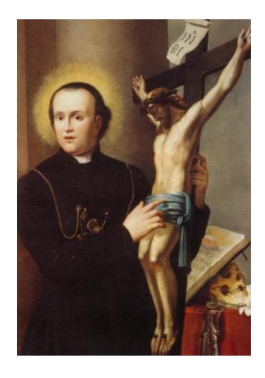
Voice of the Founder

"To utter the name Jesus is to make known the dignity of the Redeemer...by referring to the Blood of Jesus Christ is to make known the dignity of the Redemption" (Letter 1133).