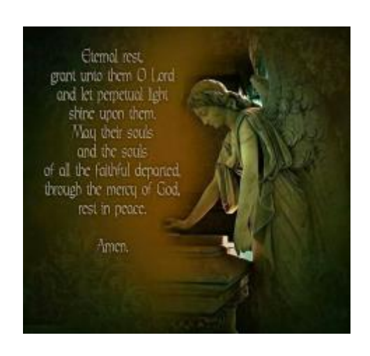
In your charity please remember

June 11-15, 2018 Mt. Carmel Centre; Niagara Falls, ON