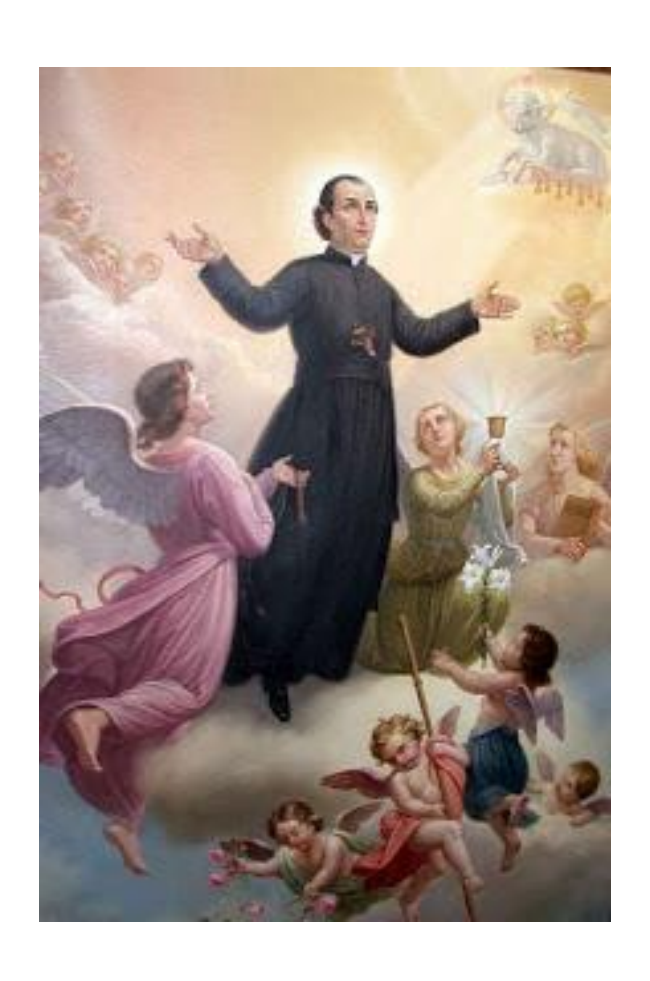
St. Gaspar del Bufalo, Pray for us!