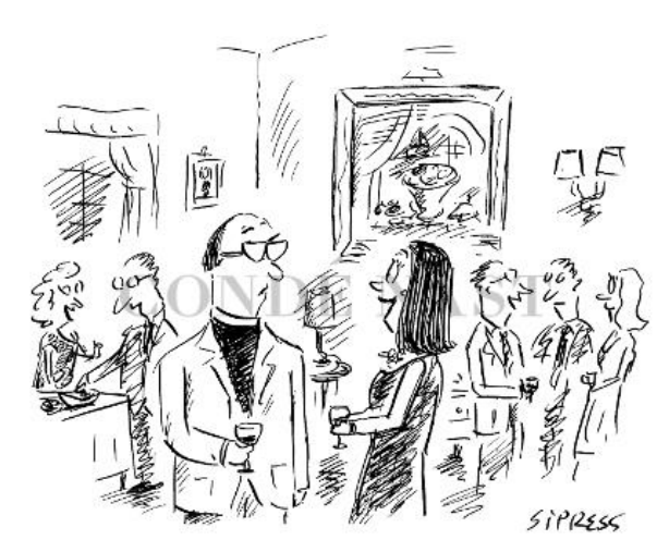
"Do you think of yourself as a spiritual person?"

At the next meeting, the work of updating the vocation and formation programs will commence. Members of the province will be kept abreast of any proposed changes.