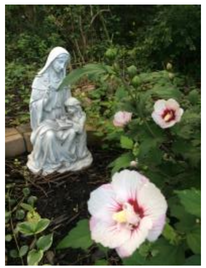
St. Anne Garden; Rochester Mission Hose