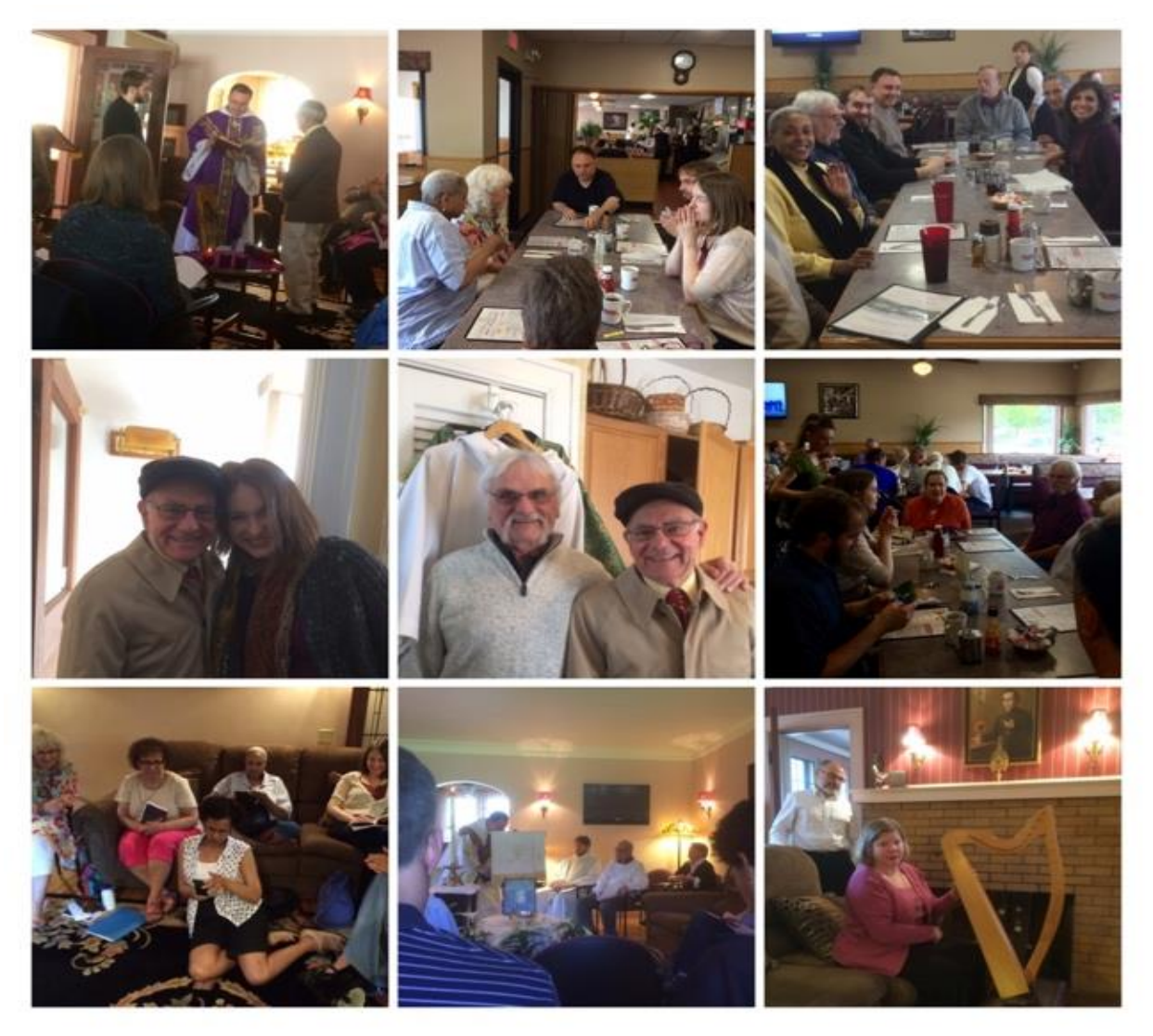
Scenes from the Rochester Mission House