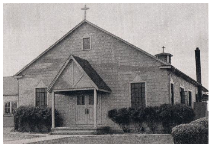
Most Precious Blood Church, Rochester, NY (1939)