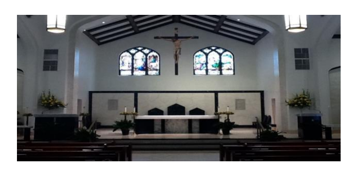
Our Lady of Mt. Carmel today